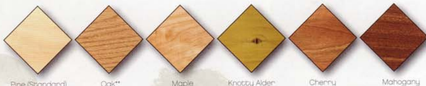
Pine (Standard) Oak** Maple Knotty Alder Cherry Mahogany