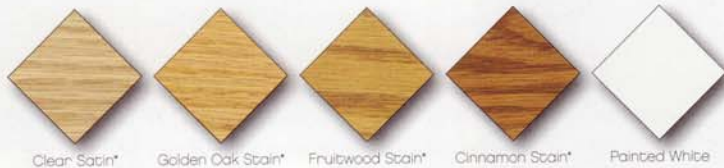
Clear Satin* Golden Oak Stain* Fruitwood Stain* Cinnamon Stain* Painted White