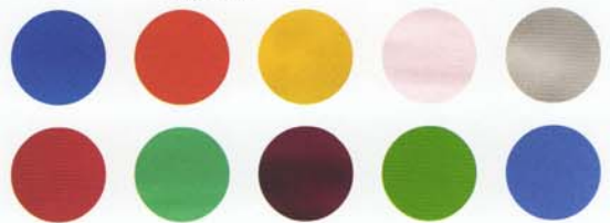
Accent color options